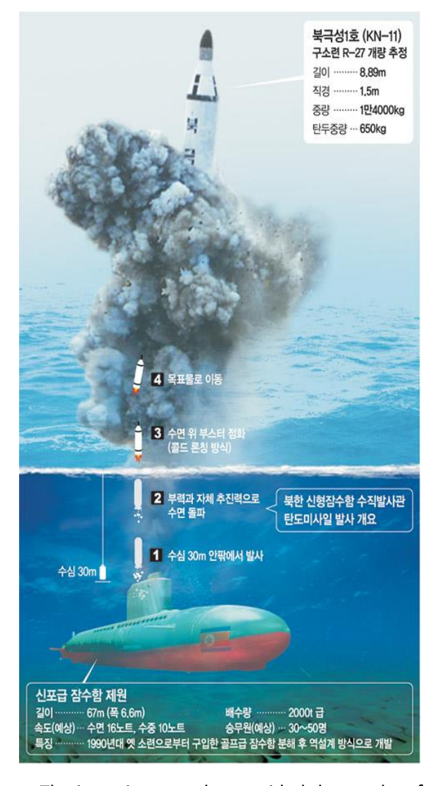
Figure 3. SLBM(Polar Star 1) test launched by North Korea.

The interviewees who provided the results of this study are an expert group of South Korea, consisted of 20 active military officers (5 from the Army, 5 Navy, 5 Air Force, and 5 from the Marine Corps), and the analytical results are summarized from April 2018.