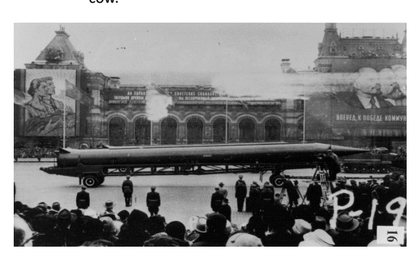
Figure 2. The CIA's photograph of the Soviet's medium range ballistic missile(SS-4 in US documents R-12 in Soviet documents) in the red square moscow.

In this incident, the United States issued an official statement that it would take it as a declaration of war if the Soviet Union completed the missile base and that it would face the third World War if necessary.