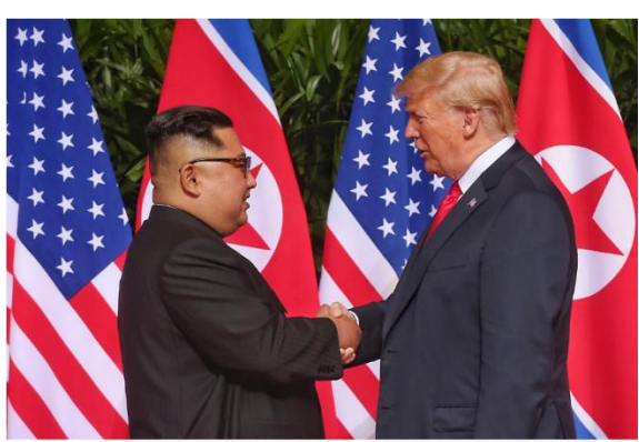
Figure 1. 2018 North Korea-United States summit.

In 2018, North Korea reached an agreement after negotiating the denuclearization at the 2018 North Korea-US Summit after the launch of the North Korean ICBM Polar Star 2 in 2018, but six months have passed, and no result has been achieved. The following <Figure 4> is the 2018 North Kora-US Summit.